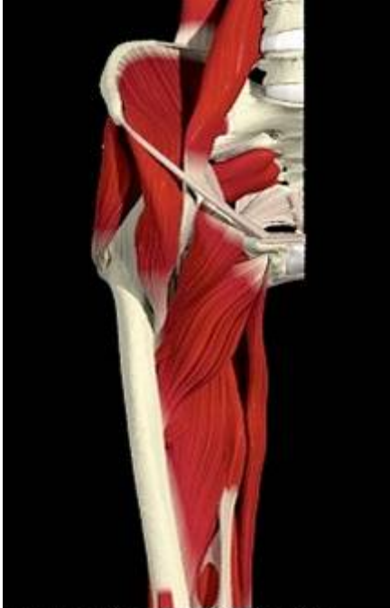
Muscles of the anterior hip, including iliopsoas, pectineus, adductor and gracilis origins.

Have the patient prone or supine. As you passively take the thigh into internal rotation, you palpate which fibers of what adductor muscles are tightening. You can start by just putting pressure on those fibers, as you passively take the limb into further motion in the restricted direction. You can add a three-dimensional pressure with your left hand, using myofascial release principles. In other words, use your educated hand to feel for the three-dimensional barriers within the tight band and release, either in the direction of the barrier (direct) or in the direction of ease (indirect).